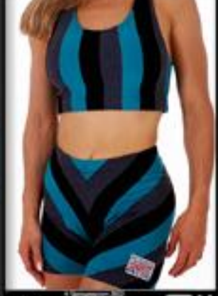
G5-2371 $26 A7-2371 $25