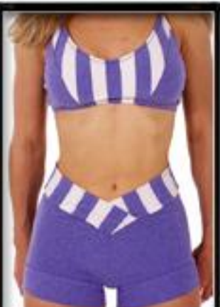
G8-2310/2399 $28 A2-2310/2399 $28