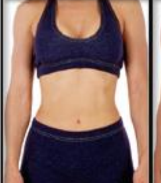
G4-2309 $24 A1-2309 $25