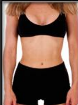
T11-1307 $24 A1-1307 $25