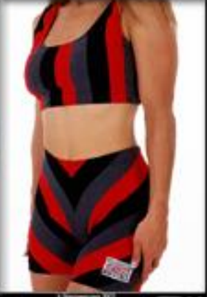
G6-722 $26 A7-722 $25