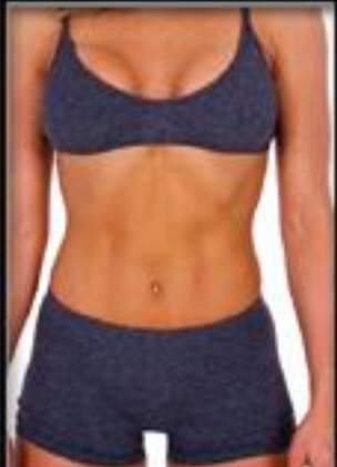
T11-2369 $24 A1-2369 $25