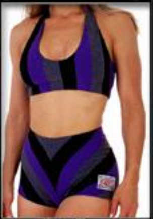
G4-2370 $24 A8-2370 $25