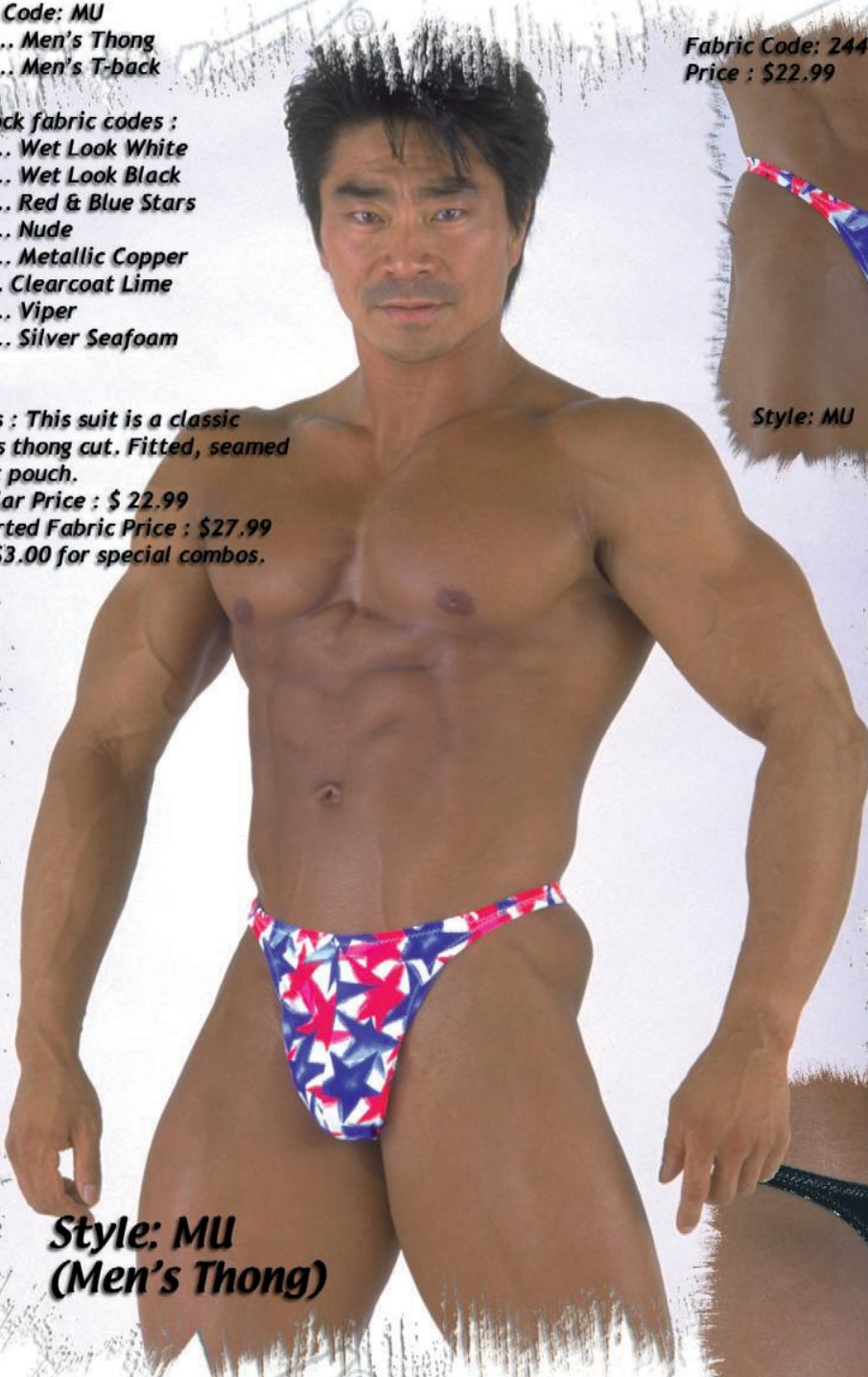
Style: MU (Men's Thong)

Notes : This suit is a classic man's thong cut. Fitted, seamed front pouch. Regular Price : $ 22.99 Imported Fabric Price : $27.99 add $3.00 for special combos.