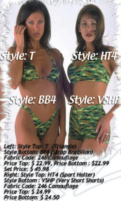
Style: T Style: HT4 Style: BB4 Style: VSHP

Left: Style Top: T (Triangle) Style Bottom: BP4 (Strap Brazilian) Fabric Code: 246 Camouflage Price Top: $ 22.99, Price Bottom : $22.99 Set Price: $ 45.98 Right: Style Top: HT4 (Sport Halter) Style Bottom : VSHP (Very Short Shorts) Fabric Code: 246 Camouflage Price Top: $ 24.99 Price Bottom: $ 24.50 Set Price: $ 49.49