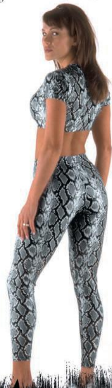
Figure on Left Style Top: CBT8 (Cropped Baby Tee) Style Tights: BZ5 (Tights) Fabric Code: 806 Clearcoat Cobra Price Top: $ 29.99 Price Tights: $ 41.50 Set Price: $ 71.49 Figure on Right Style Top: TSB (Bandeau Top) Style Skirt: SMM (Slit Mini Skirt) Fabric Code: 806 Clearcoat Cobra Price Top: $ 27.99 Price Skirt: $ 29.99 Set Price: $ 57.98

BULK RATE U.S. POSTAGE PAID CLEARWATER, FL. PERMIT NO. 892