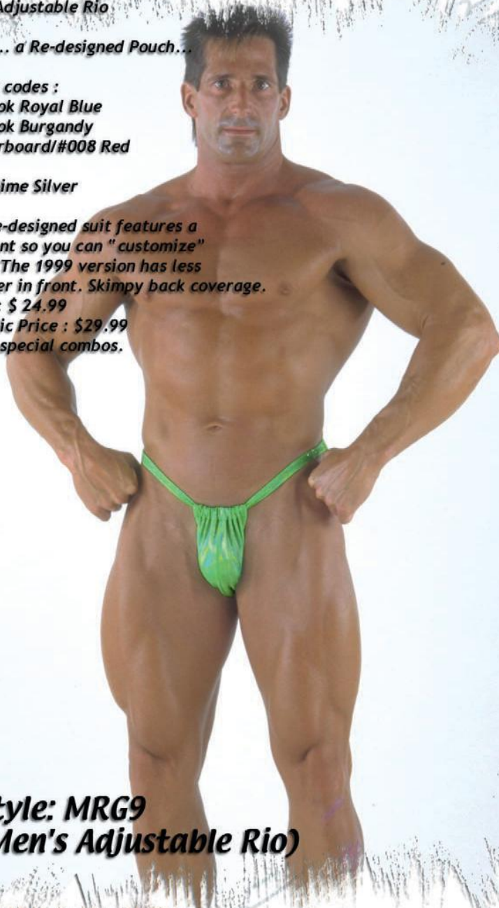
Style: MRG9 (Men's Adjustable Rio)

Notes : This re-designed suit features a adjustable front so you can "customize" the exposure. The 1999 version has less fabric to gather in front. Skimpy back coverage. Regular Price : $ 24.99 Imported Fabric Price : $29.99 add $3.00 for special combos.